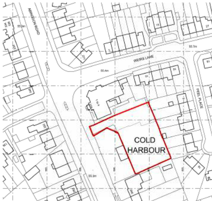
Site Location Plan 1:1250 @ A4